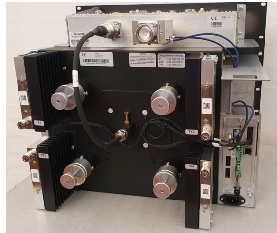
4 ch. Combiner, Tx-filter & Digital Power Monitor

The base configuration is 4 channels with DPM and it can be expanded by 2 channels.